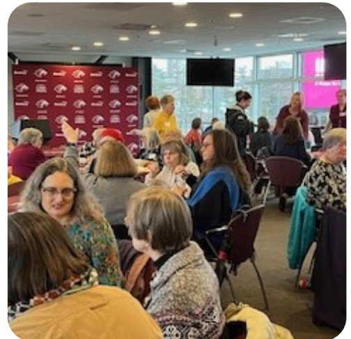
Attendees enjoying fellowship and conversation.