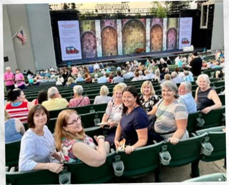
Beautiful-Carol King Musical at the Muni