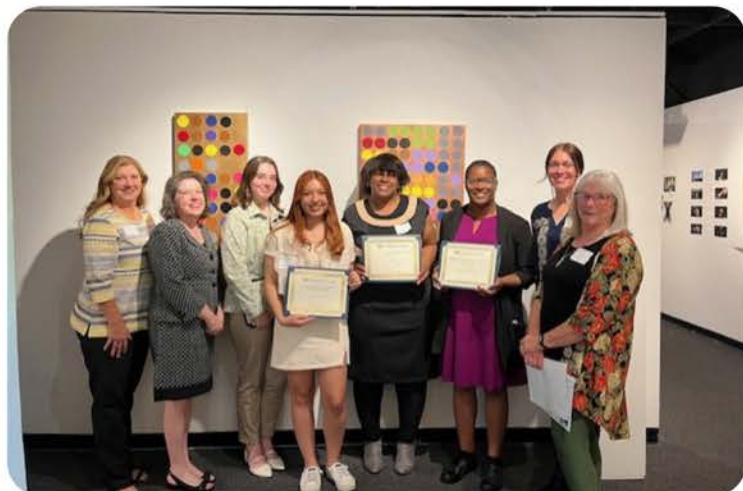
2024 Scholarship Recipients with the Scholarship Selection Committee.