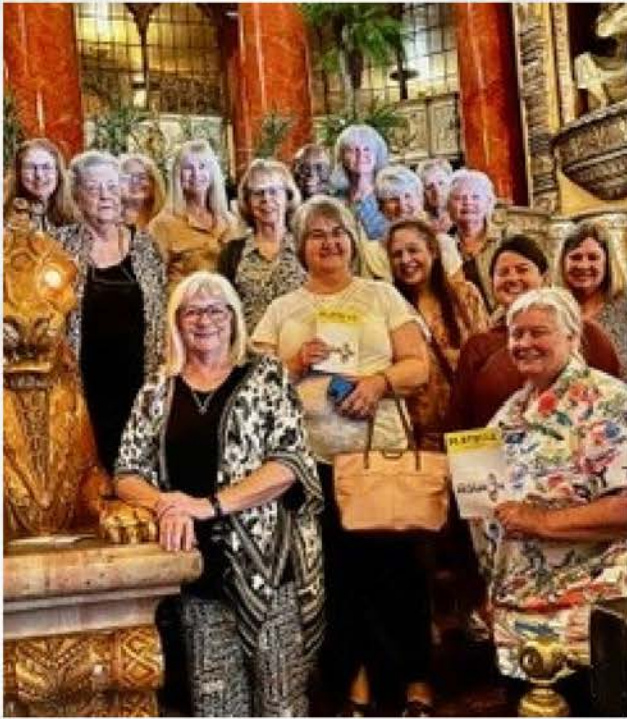
The Book of Mormon Fabulous Fox Theater