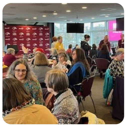
Attendees enjoying fellowship and conversation.